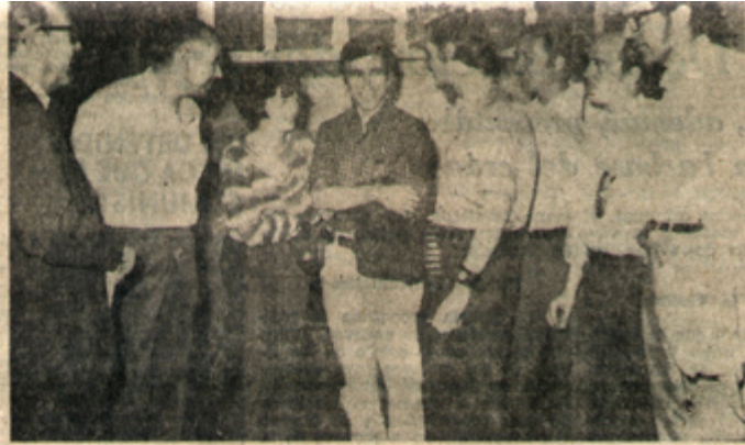
ARTISTAS PLASTICOS ROSARINOS de vanguardia que visitan nuestra provincia para desarrollar un plan cultural.