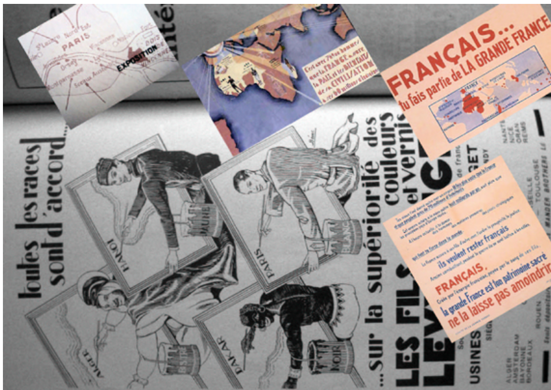
Mapping of the 'Plus Grande France': exhibition location in relation to the city – poster with world map for the Exposition Coloniale Internationale – appeal to the 'Citoyens' – advertisement for artist paint from the 'Guide officiel'