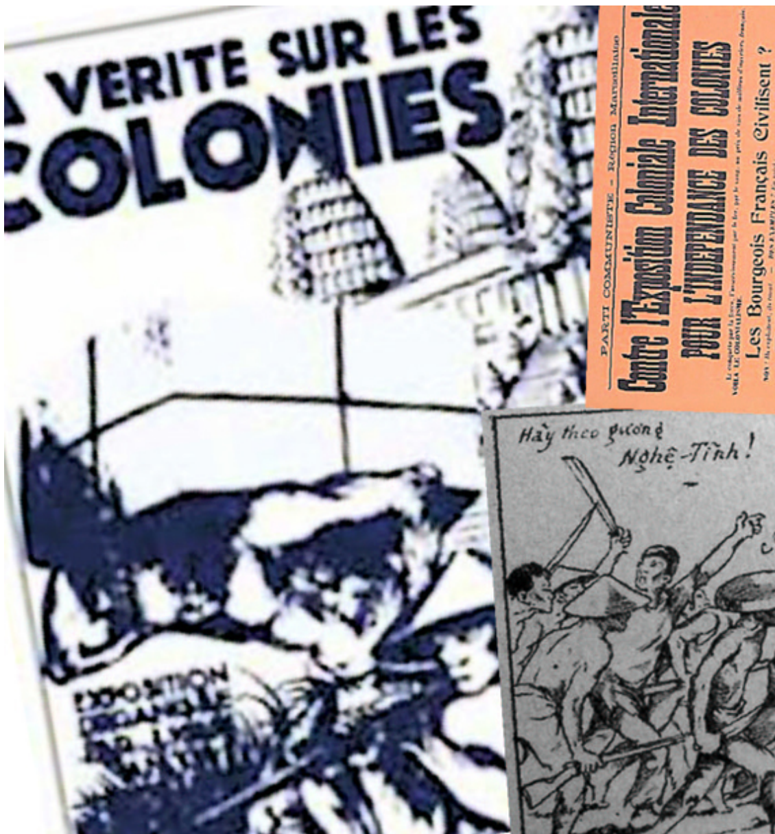
C.A.I. archive: protest material