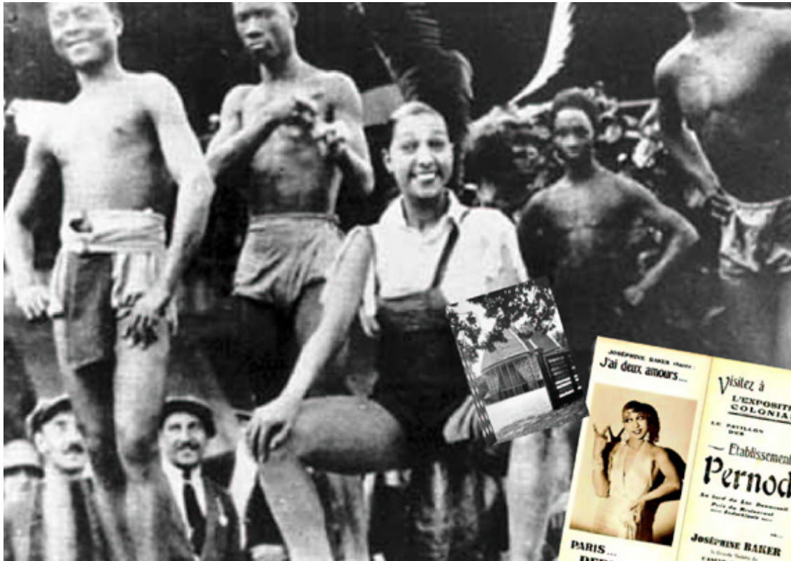
«Coloniale culture»: Josephine Baker as «Queen of the Colonies» with her troop at the Exposition Coloniale 1931 – Pernod advertisement with Josephine Baker and her song «J'ai deux amours...» for the 1931 exhibition – «Pavillon Togo-Cameroun»